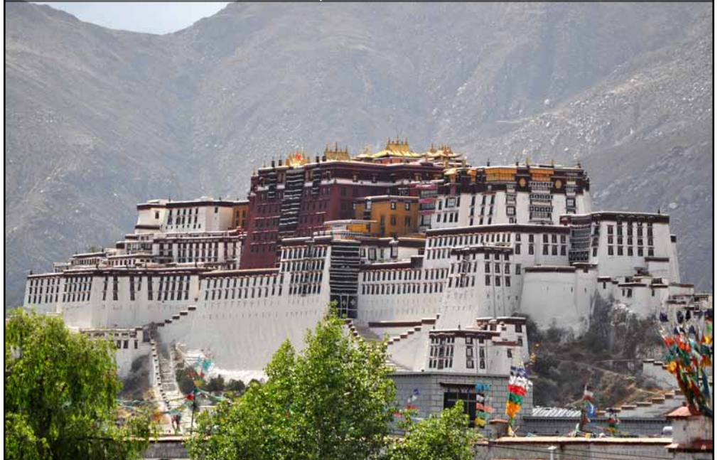
The famous Potala Palace in Lhasa, Tibet. Potala Palace means Holy Palace in The Snow Land.